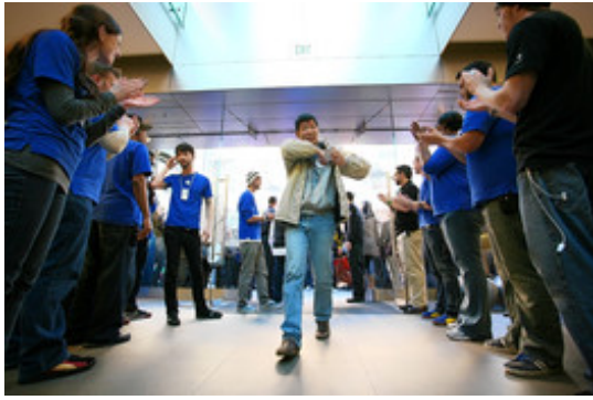
When a new product is launched, such as the second-generation iPad in March, employees cheer customers as they enter and exit the store.

roughly 7%. In 2010, Apple's retail sales, excluding online, jumped 70% to $11.7 billion, or about 15% of its revenues of $76.3 billion, handily exceeding the overall retail industry's sales growth of 4.5%.