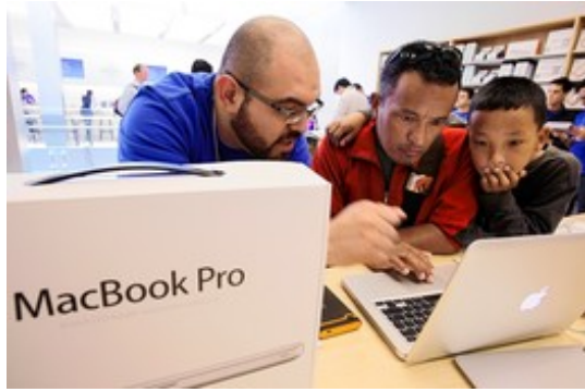
Apple employees are trained to demonstrate products and solve customer problems rather than push sales.